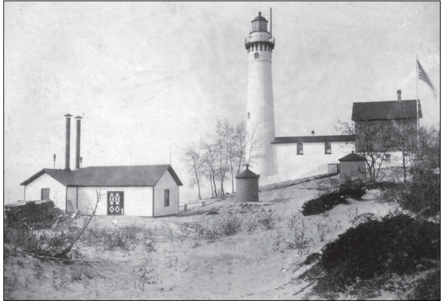
South Manitou Island light station as it appeared circa 1890

Once we dock on South Manitou Island, there will be a quarter mile walk to the lighthouse. Of special interest for this