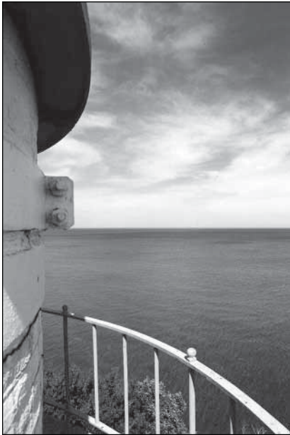
The view from the gallery of the 1857 Pointe aux Barques light station

Sunday morning will begin with participants driving their own cars to the Pointe aux Barques Lighthouse and museum. Society president Bill Bonner will make a presentation about the lighthouse, and participants will be able to tour the grounds and museum, as well as climb the tower.