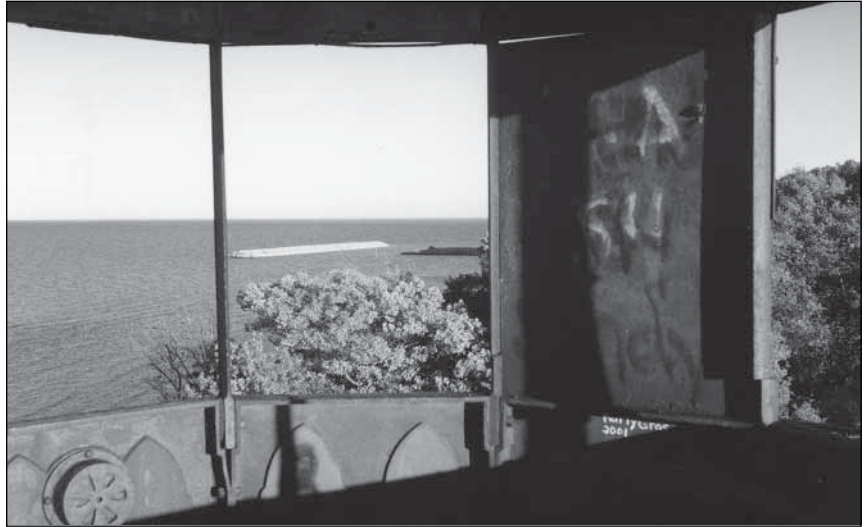
For those wishing to take advantage of the opportunity, a climb of the old 1857 lighthouse tower on Charity Island affords a unique vista of Saginaw Bay

complimentary soft drinks, bottled water, coffee and appetizers. Upon arrival at Charity Island, we'll have an informative and entertaining history presentation in the island's pavilion. The presentation will include information about the island geology, its endangered plants, and the lighthouse. Included in the lecture will be personal stories of the men who kept the light burning during stormy nights.