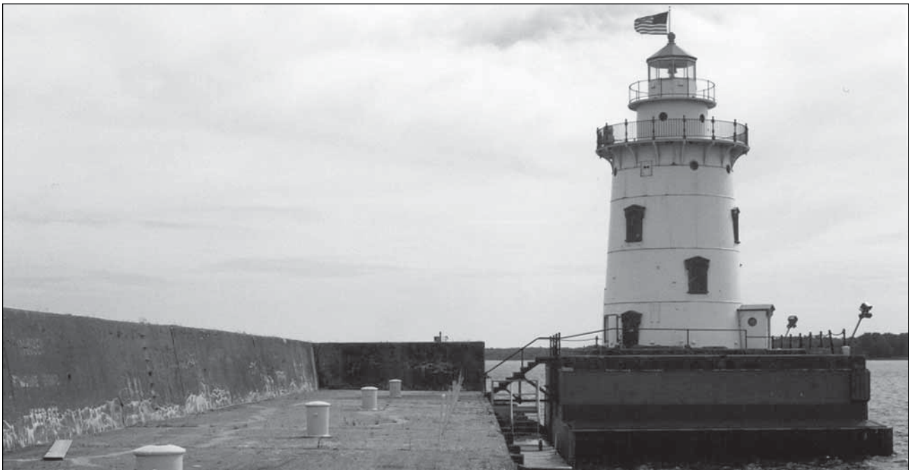
The opportunity to tour the Harbor Beach lighthouse is a rare opportunity indeed. Attendees are in for a real surprise at this lighthouse, as without publicity the Harbor Beach Lighthouse Preservation Society has completely restored the lighthouse from top to bottom

Because of limitations due to the size of the Charity Island boat, this tour will be limited to the first 48 reservations received. For more information or to make reservations, please call the GLLKA office at 231-436-5580 between 9:00 a.m. and 4:00 p.m., Monday through Friday.