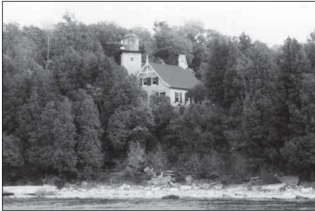
Seeing Eagle Bluff from the water provides a unique perspective

A special rate for rooms has been arranged at the Wagon Trail Resort. Specific details will be mailed upon receipt of the reservation fee. This is a great opportunity to view most of the lighthouses of Door County.