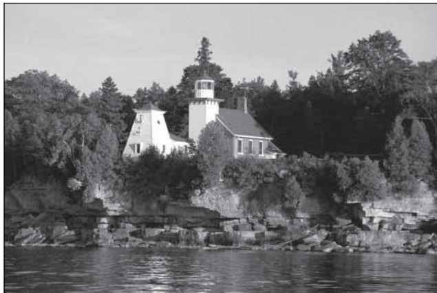
The 1883 Sherwood Point lighthouse as seen from the water