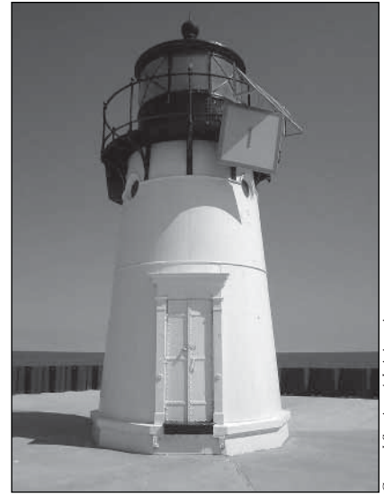
General Services Administration

We then head to Conneaut to obtain a close-up view of the 1935 Conneaut West Breakwater light. One of the last lighthouses built on the Great Lakes by the Lighthouse Service before the Coast Guard took over responsibility for the nation’s aids to navigation in 1939; this lighthouse is a virtual twin of the Huron Harbor light we saw the prior day. Our last stop for this excursion will be a close-up view of the 1905 Ashtabula lighthouse which was moved to its current location on the extended breakwater in 1915.