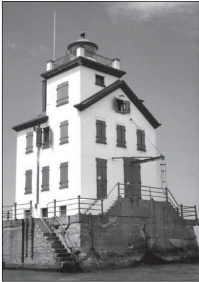
Lorain Port Authority