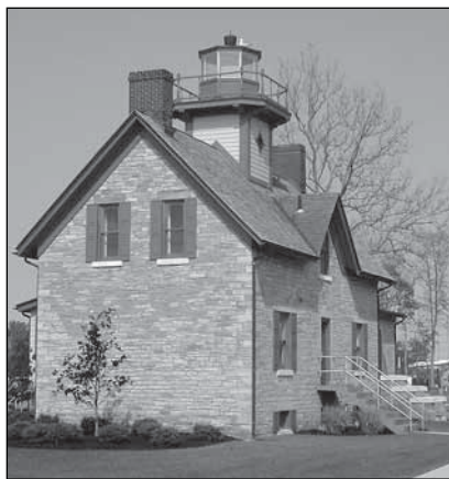
The restored 1839 Cedar Point lighthouse

After breakfast in the Island House at 7:00 AM, we will board a motor coach at 8:00 AM for the short drive to the Cedar Point Amusement Park. After passing quickly through the park gates, we will drive through the park to view the 1839 Cedar Point Lighthouse. After a complete exterior restoration, this lighthouse now serves as the focal point for the Park's "Lighthouse Point" cottage area. We then step back on the motor coach for the ride to Ashtabula,